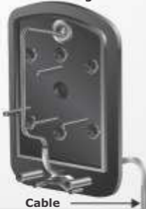
External wiring cable route