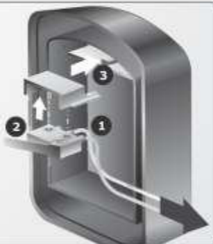
To third party alarm system