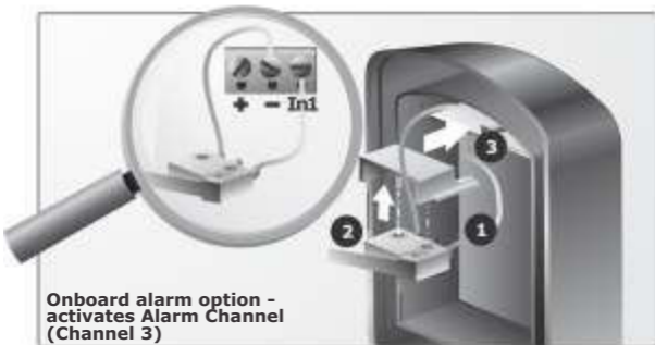
Onboard alarm option - activates Alarm Channel (Channel 3)